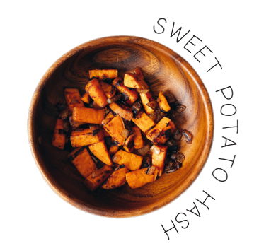
CHOOSE YOUR EGG: